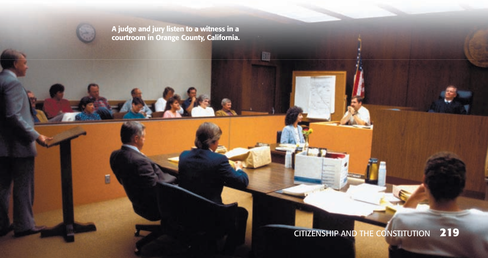
A judge and jury listen to a witness in a courtroom in Orange County, California.

In suits at common law, where the value in controversy shall exceed twenty dollars, the right of trial by jury shall be preserved, and no fact tried by a jury, shall be otherwise reexamined in any Court of the United States, than according to the rules of the common law.